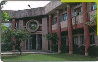
SCHOOL OF MATHEMATICAL SCIENCES