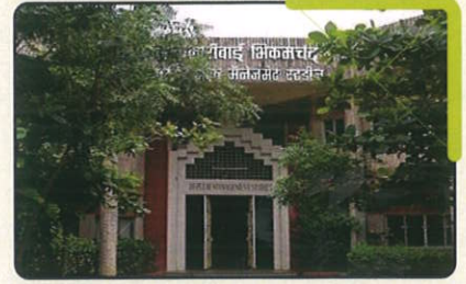
SCHOOL OF MANAGEMENT STUDIES