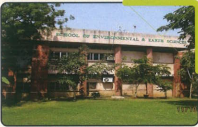
SCHOOL OF ENVIRONMENTAL AND EARTH SCIENCES