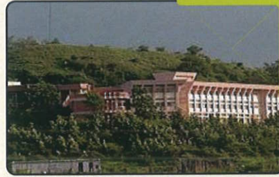
SCHOOL OF PHYSICAL SCIENCE