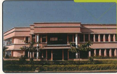
SCHOOL OF COMPUTER SCIENCES