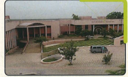
UNIVERSITY INSTITUTE OF CHEMICAL TECHNOLOGY