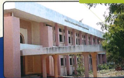
SCHOOL OF EDUCATION