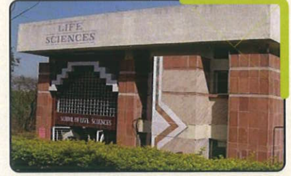
SCHOOL OF LIFE SCIENCES