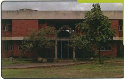
SCHOOL OF LANGUAGES STUDIES & RESEARCH CENTER