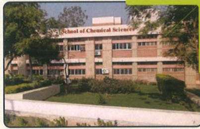
SCHOOL OF CHEMICAL SCIENCES