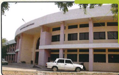
SCHOOL OF SOCIAL SCIENCES